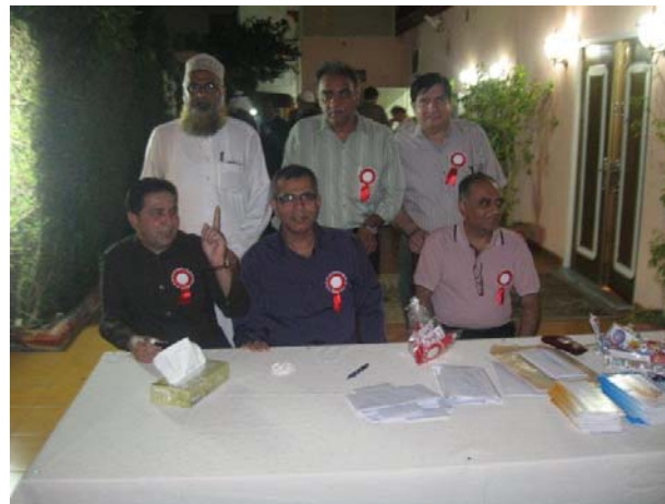
Guests Welcome Committee