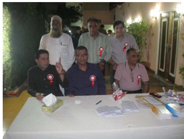
Guests Welcome Committee