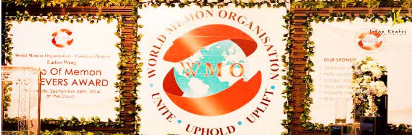
The Compilation of profiles was done by Sumrin Kalia

Post humous Tributes Pride of Memon Achievers Awards 2014 by WMO Ladies Wing Pakistan Chapter