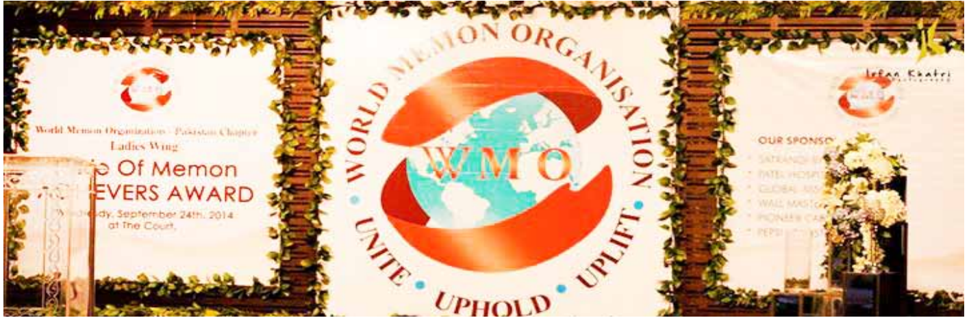
The Compilation of profiles was done by Sumrin Kalia

Post humous Tributes Pride of Memon Achievers Awards 2014 by WMO Ladies Wing Pakistan Chapter