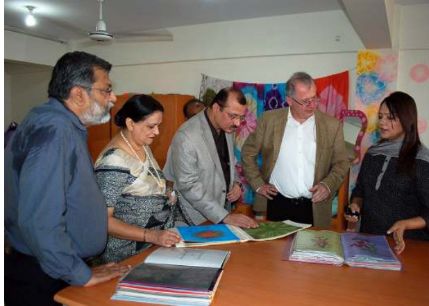
The Textile Designing Workshop in Ladies Section of MITI