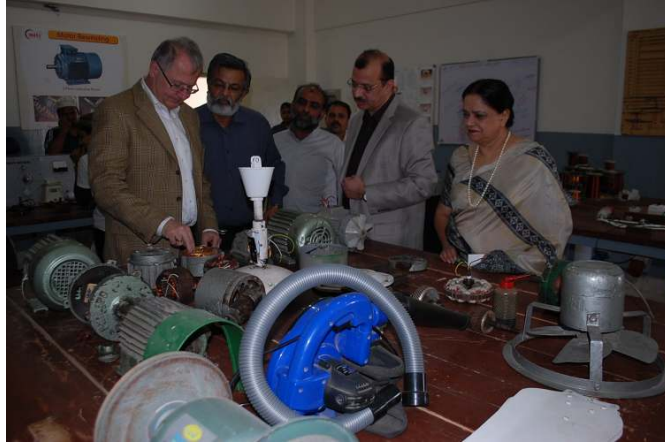
Motor Rewinding Department at MITI

He emphasized that there was a need to have courses of longer duration, at least Diploma Programs, so that the qualified students get the opportunity of lucrative jobs in Germany and other European countries.