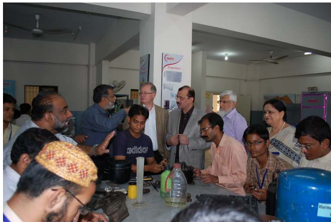
Refrigeration & Air Conditioning Department at MITI

He emphasized that there was a need to have courses of longer duration, at least Diploma Programs, so that the qualified students get the opportunity of lucrative jobs in Germany and other European countries.