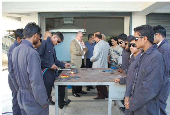
Welding Department at MITI

Later during the briefing, he was apprised of the details about the Institute and the various technical & vocational courses being offered, the number of students, the management structure, etc.